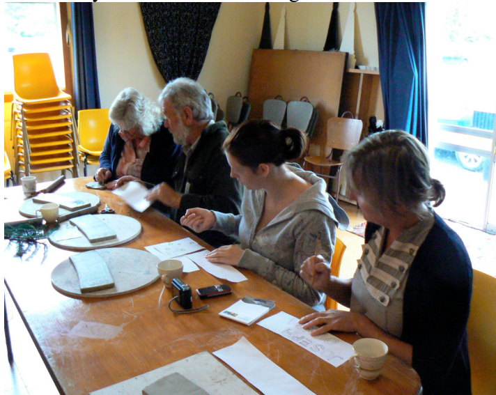
Pike River families designing the tiles