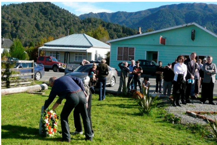
Laying of wreath at Workers Memorial Day service